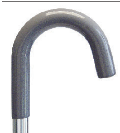
6220A: Vinyl Grip