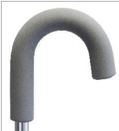
6221A: Foam Grip