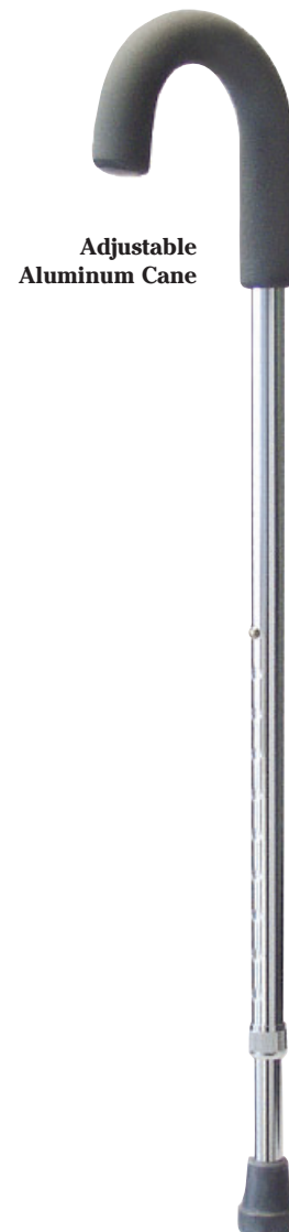
Adjustable Aluminum Cane