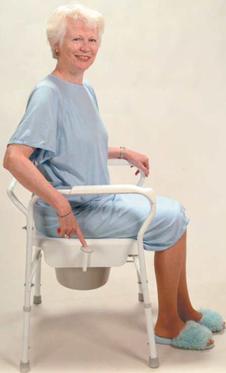
The Commode Assist eases you gently into a seated position and automatically locks in place. To stand, simply press down on the seat release lever (see below).