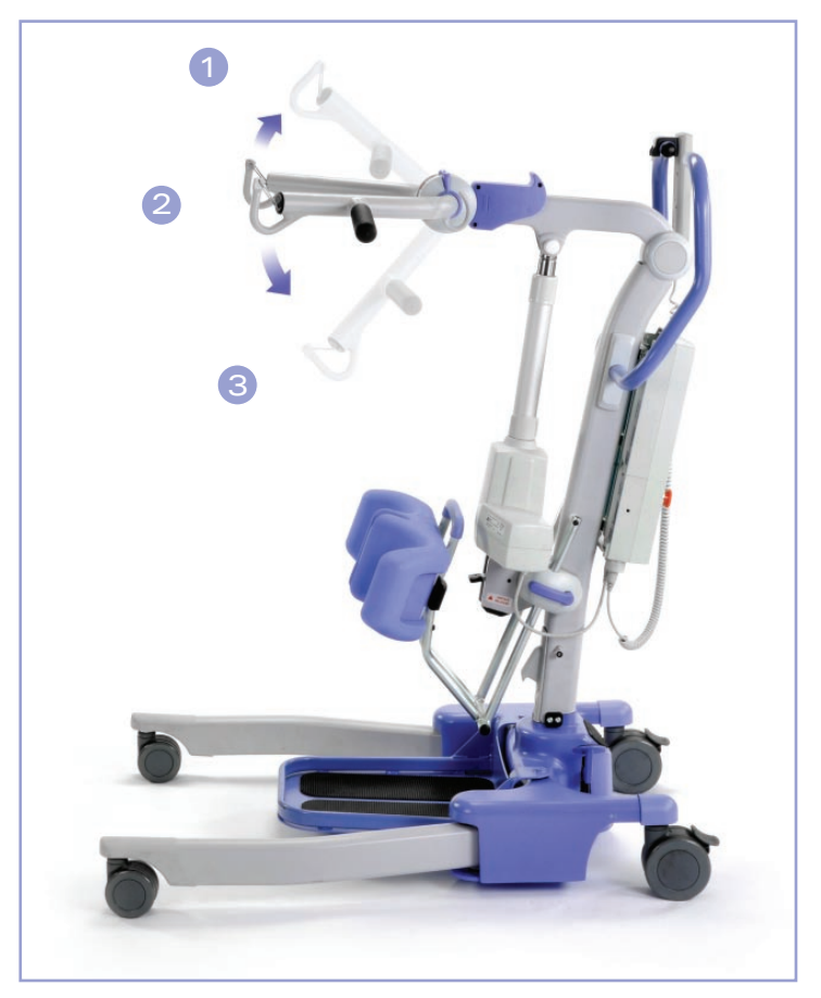
The Journey's three optional cow-horn positions.

With three different cow-horn height options, the Journey can support a wider range of patient heights and sizes. This additional method of adjustment ensures total flexibility for the care-giver.