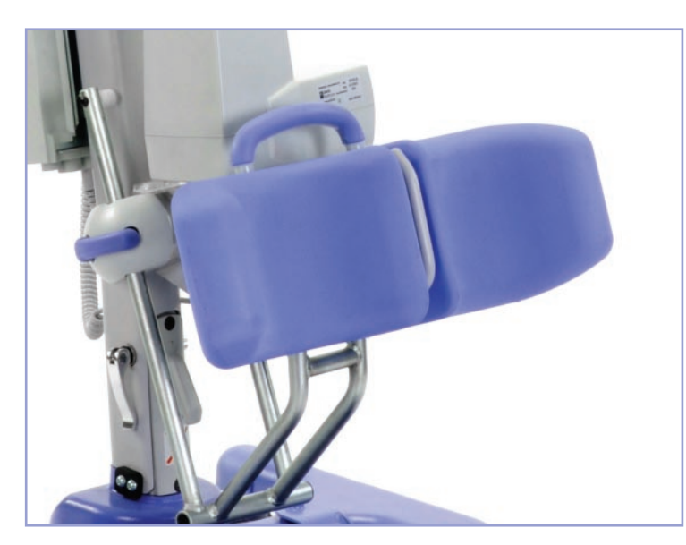
The knee pad is contoured for improved patient comfort and is easy to clean to help prevent cross infection.

The Journey's knee pad is height adjustable to ensure the patient feels comfortable and fully supported throughout the transfer.