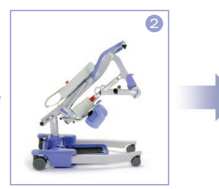
Next, unlock the mast-locking device and lower the mast assembly towards the legs.