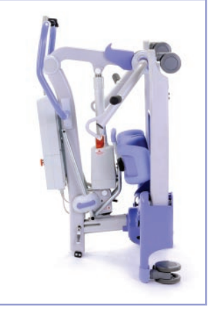
In environments where space and storage are at a premium, the Journey can fold quickly and be stored upright to conserve storage space.