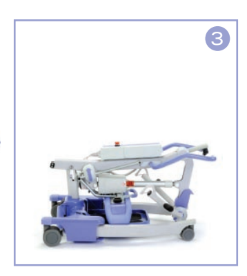
The mast then locks into position. The Journey is now ready to be stored or transported.