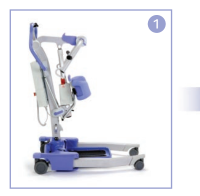
To fold the Journey, adjust the cow-horn to the fold position then raise the knee pad to its upper most point.

Unlike any other standaid on the market, the Journey can fold making it easy to transport and store. This functionality gives active users the option to travel outside the confines of their own home.