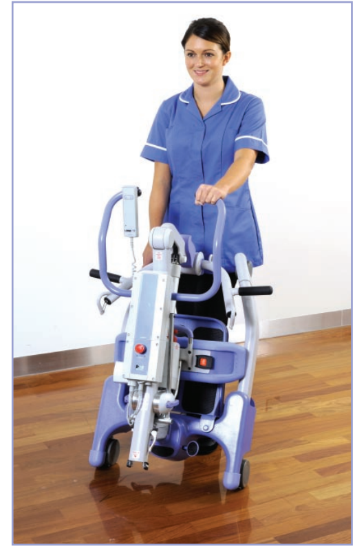
With its quick-release technology, the Journey folds or unfolds in a matter of seconds without the need for tools or special attachments.