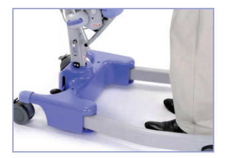
Foot tray removed for gait training.